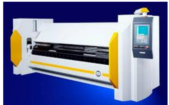
RAS FOLDING MACHINE