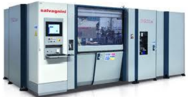
SALVAGNINI P2XE Panel Bender