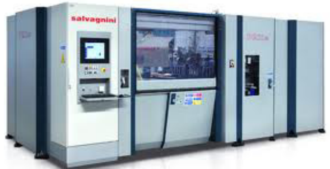
SALVAGNINI P2XE Panel Bender