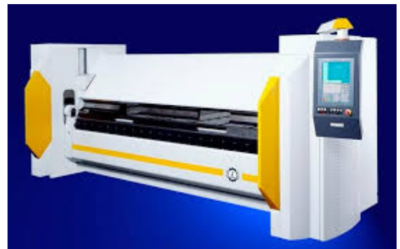
RAS FOLDING MACHINE