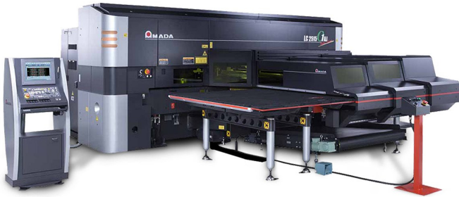
1 AMADA LC 2515 C1 AJ Punch/Fiber Laser Combination