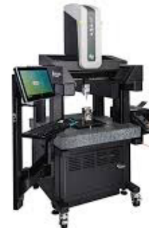
Hexagon 7.10.7 SF CMM